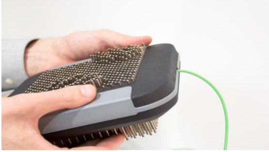
Fig 3. MATRIX

The MATRIX (Multipurpose Array of Tactile Rods for Interactive eXpression) is a special interactive device to capture complete movement of the human palm and fingers over a bed of spring forced push rod.